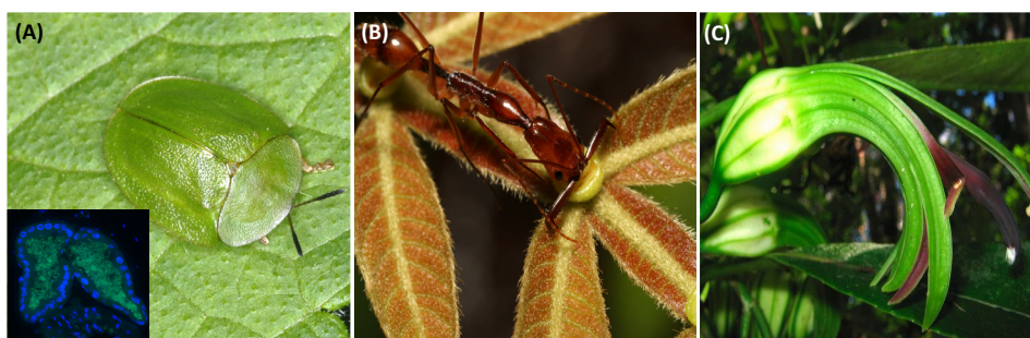
Trends in Ecology & Evolution